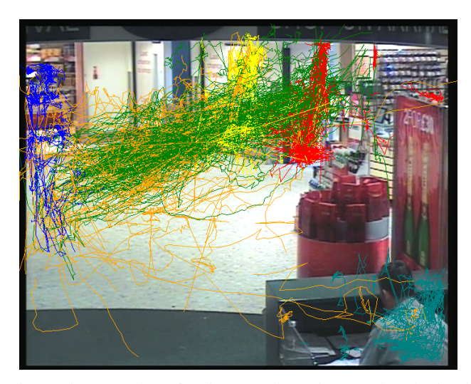
Figure 5: Examples of trajectory clustering results obtained by EM algorithm on trajectories from the first camera.

using the EM algorithm mentioned above. Different colors of trajectories refer to different clusters. We have prepared also an outliers analysis within the VideoTerror project.