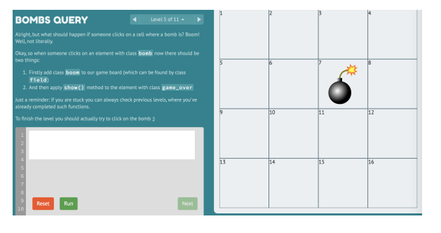
Figure 3: bombsQuery interface example.

The developed assignment was already given to students in the Web Development course at Brno University of Technology. It is in the form of web platform named bombsQuery (Figure 3) and is aimed to teach the basics of jQuery. The narrative is going around the need to clean the field from all bombs, marking them with the help of white flags. To make it work, students need to write a particular part of the jQuery code, as described in the task. Apart from the text of the task, each level contains some theoretical part, hints for the students and examples. Developed platform is opensource<sup>1</sup>. Feedback from students has shown their great interest in such kind of tasks, and a high level of motivation and involvement [22].