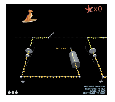
Figure 4: Example of a level in Current Surf.